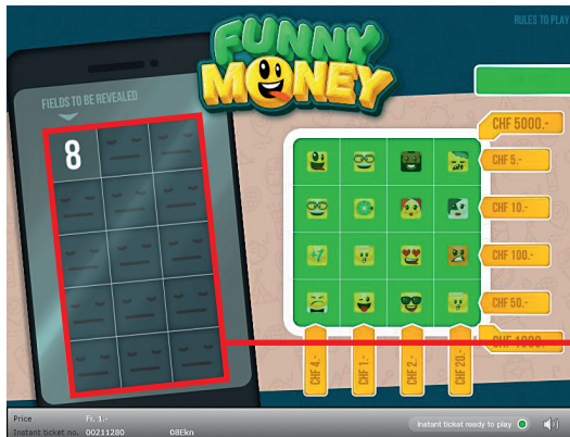
Example: Win CHF 9.–